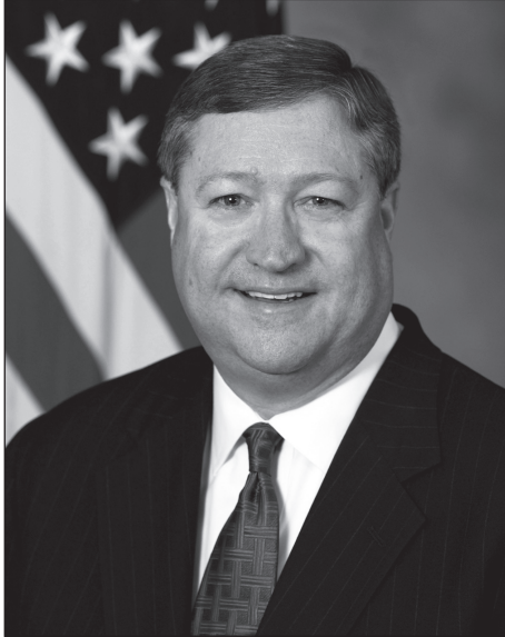
Michael B. Donley Secretary of the Air Force

reflects our rich heritage and continuing commitment to provide decisive air and space power on behalf of national leaders and the Joint team. The mission statement also conveys our responsibility, along with other services and agencies, to develop capabilities for the